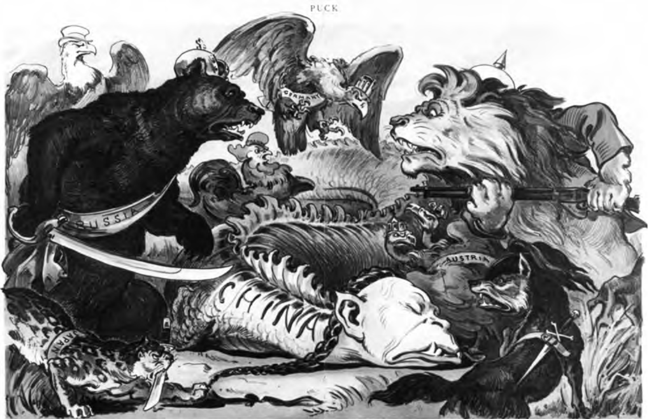
THE REAL TROUBLE WILL COME AFTER THE FUNERAL

Cartoon from an American magazine in the late nineteenth century. The caption beneath says, 'The real trouble will come after the funeral.'